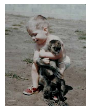
Think about your pets.