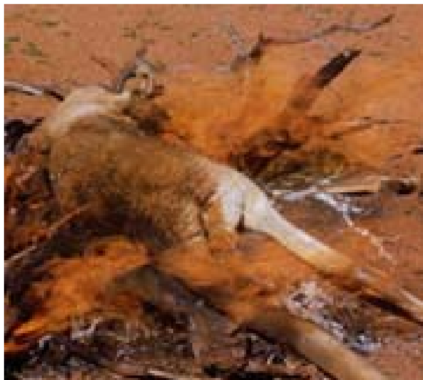
Photograph 4. Traditional cooking methods used for thousands of years may not be innocuous as believed. The present study reveals high levels of nitrous oxides and carbon monoxide in the smoke from cooking fires. Source of graphic:

Considering that the incidence of Bronchiectiasis is so high in Australian Indigenous communities, and that overseas studies show the links between wood smoke and respiratory illnesses, it is recommended that further studies be undertaken to establish evidence of the health risks of wood smoke in Australian Indigenous communities. The results of any such studies should be widely publicised to enable Indigenous people to make an informed choice about cooking fuels and cooking technologies.