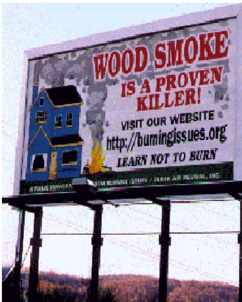
Photograph 2. Many communities in the US are concerned about the adverse health impacts of wood smoke from household heaters. Wood smoke has been found to contain a number of carcinogenic and irritating pollutants, in high enough quantities to significantly contribute to the risk of respiratory illness.