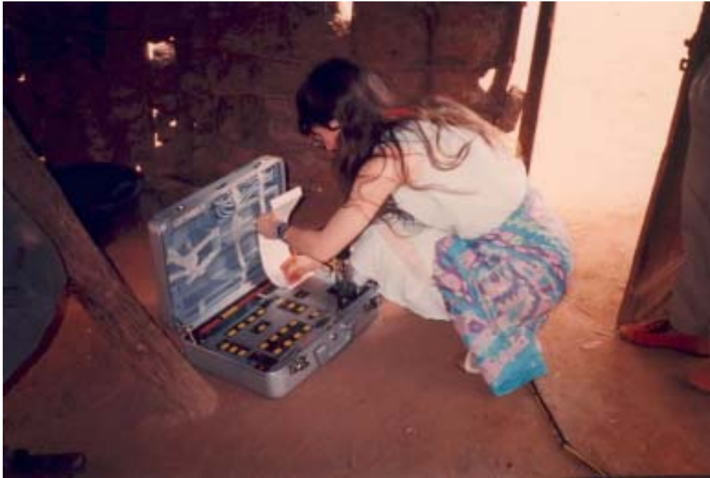
Photograph 3. Measuring emissions from cooking fires using a combustion analyser, similar to the one which was used at Daguragu, but slightly more sophisticated.